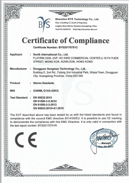
Gaming Headsets CE