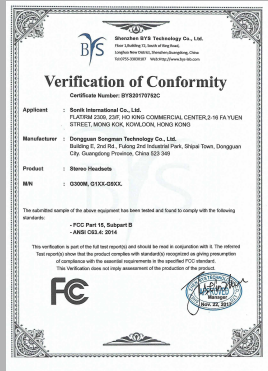
Gaming Headsets FCC