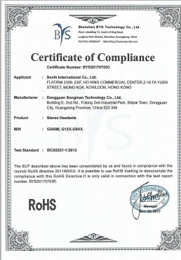
Gaming Headsets ROHS