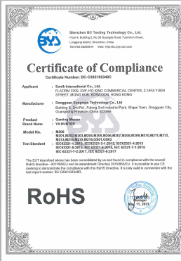
Gaming Mouses RoHS