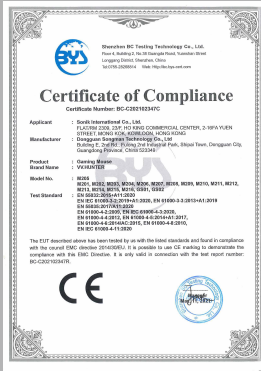
Gaming Mouses CE