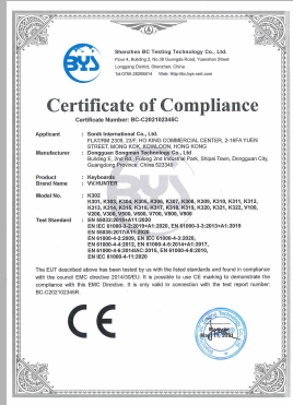
Gaming Keyboards CE