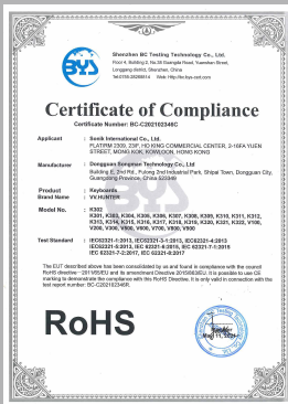
Gaming Keyboards ROHS